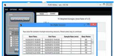
Sorts Multiple Sessions