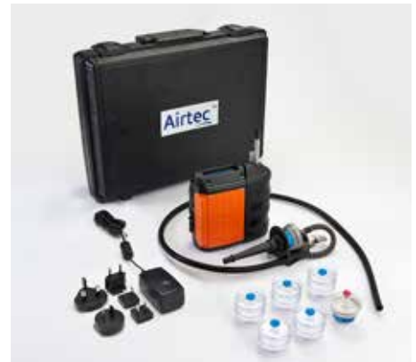
Includes Airtec monitor, inlet prefilter assembly, five filter cassettes, two prefilter cartridges, USB to mini-USB PC cable, rechargeable battery with 9 V / 2 A Universal AC adaptor (100-240V AC)