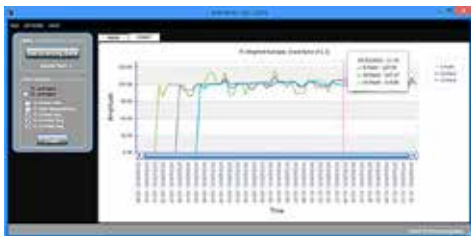
5, 10 and 15 point Running Averages