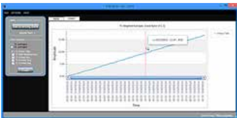
8 Hour Time Weighted Average